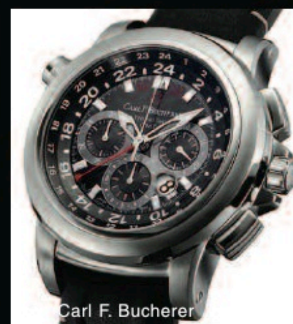
Carl F. Bucherer