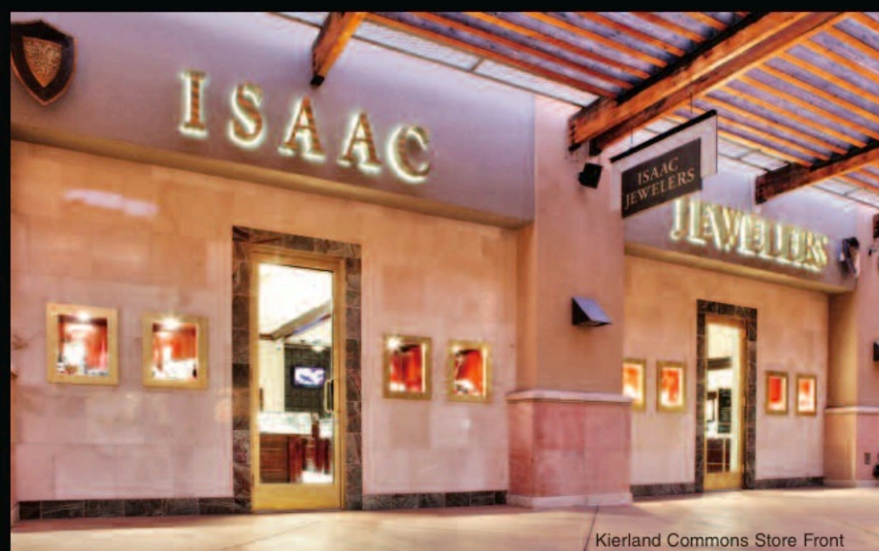
Kierland Commons Store Front